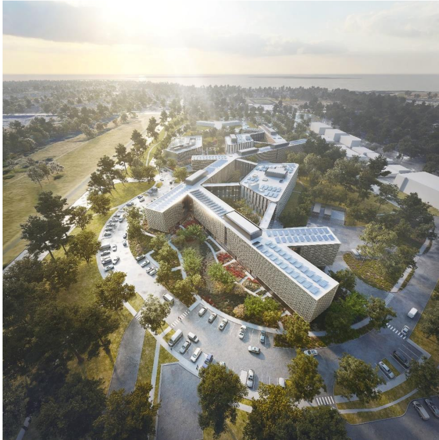
Figure 1: aerial rendering of the new WSH Forensic hospital

Washington State Arts Commission (ArtsWA) and Department of Social and Health Services (DSHS)