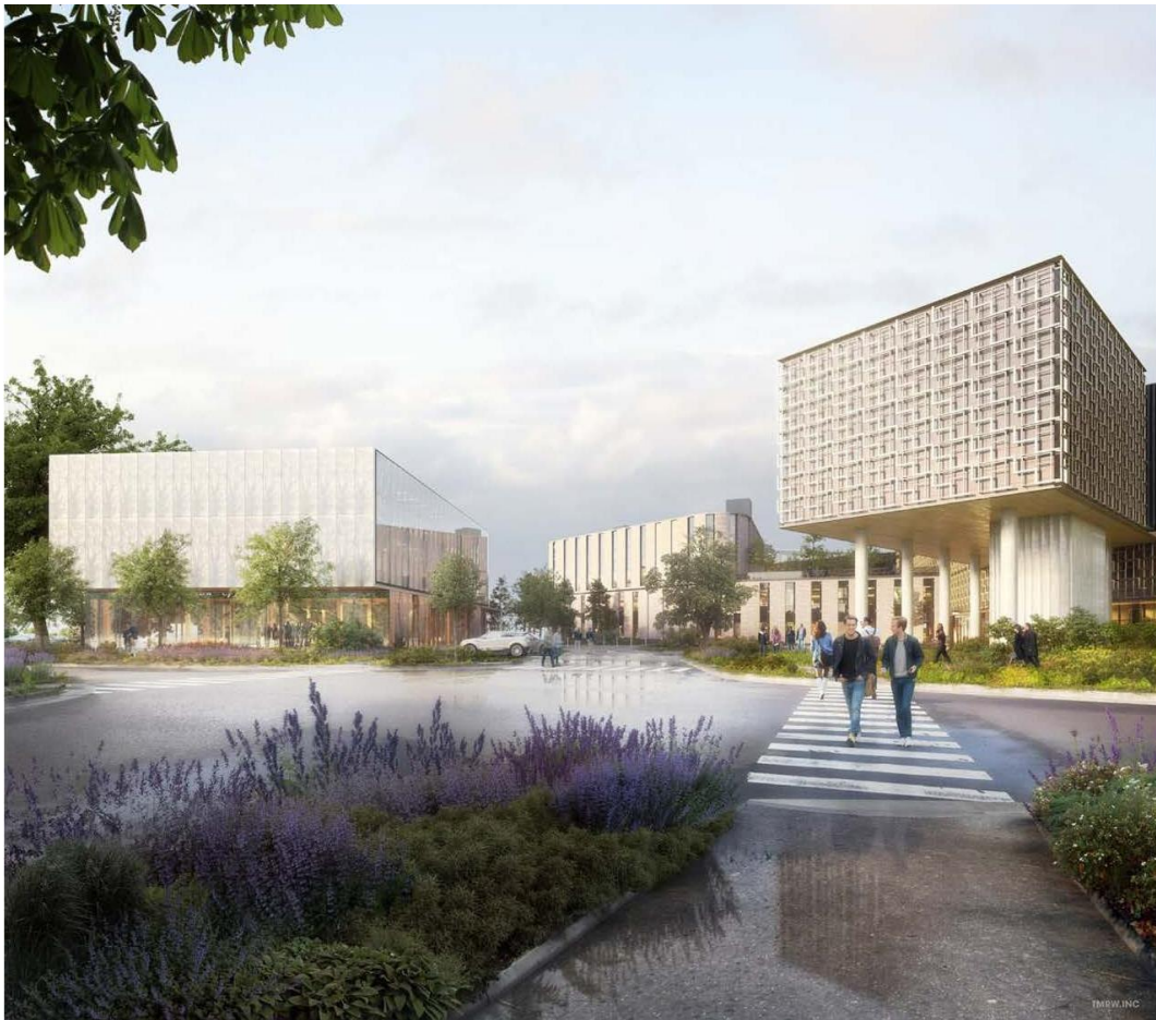
Figure 2: rendering of the new WSH Forensic Hospital main entry, looking northwest from sidewalk

Washington state's vision of transforming behavioral health includes constructing a therapeutically designed hospital on the Western State Hospital campus with 350 beds to care for forensic patients in a modern facility. The hospital will also serve as a Forensic Center of Excellence and focus on providing state-of-the-art care for forensic patients, since the new forensic hospital will serve patients who enter care through the criminal court system. The new hospital will operate in an environment of care that supports safety, the delivery of evidence-based proven practices, and working hand in hand with local academic institutions to support research and innovation.