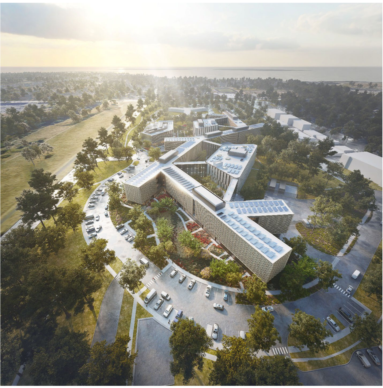
Rendering of aerial hospital view

Budget: $200,000 - $1,000,000 ($200,000 per courtyard, apply for 1-5 courtyards)