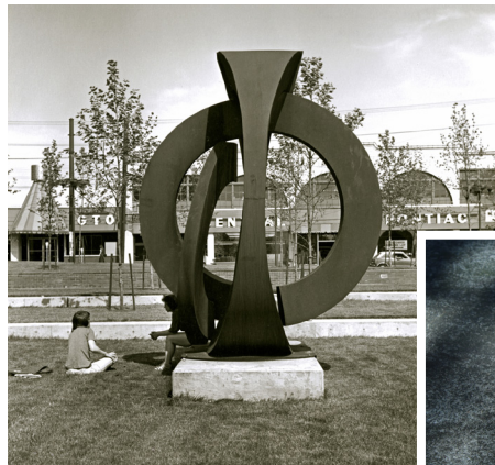
The severe condition of these artworks reflects poorly on Washington State. This funding request will repair these artworks and restore public trust.

The public relies on ArtsWA to care for the 5,000 artworks that comprise the State Art Collection. These works, including the 13 proposed for repair, are located in highly visible spaces where the public interacts with government.