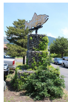
Artwork sections A, B, and C.