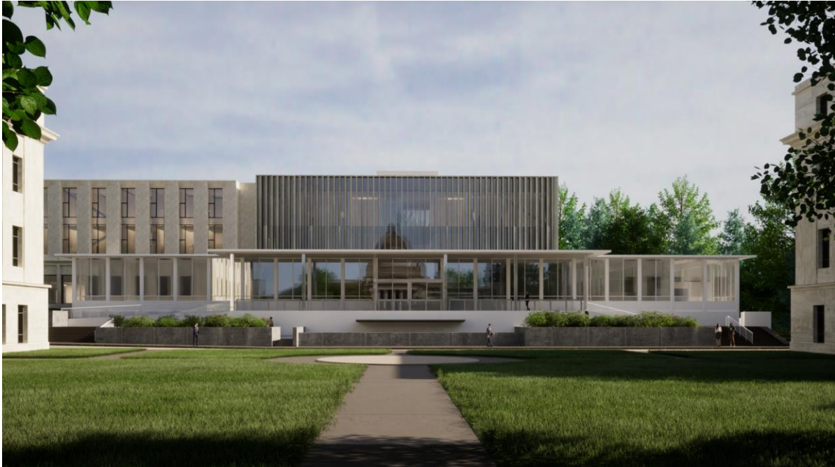
Concept rendering

Joel M. Pritchard Building Capitol Campus, Olympia, WA