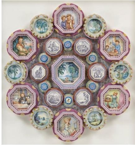
Discovery , 2006, Maki Tamura. Selected for Spokane Community College by Suzanne Beal.

Application Deadline: September 27, 2019