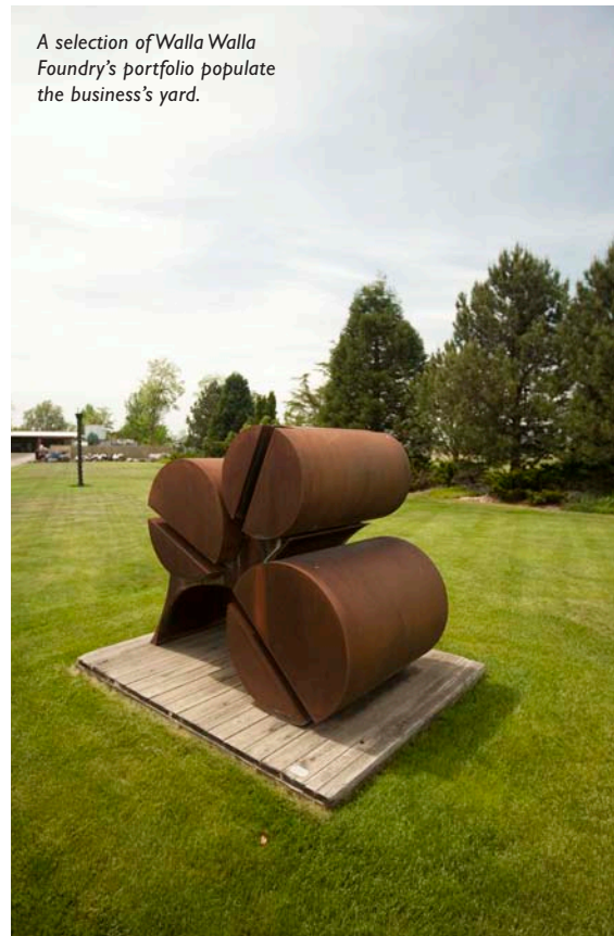
A selection of Walla Walla Foundry's portfolio populate the business's yard.

“Luckily the town is more interesting than it was 30 years ago,” he says, laughing. “I have clients visit me here and they all think that Walla Walla is a pretty fine place.”