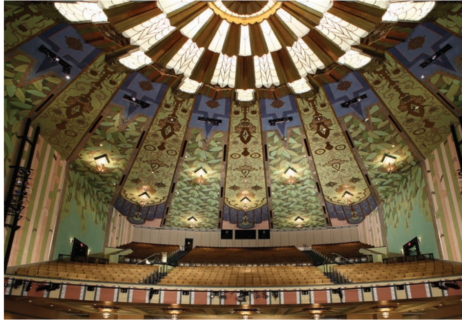
Spokane's Martin Woldson Theater at the Fox underwent a $31 million renovation in 2007 before reopening as home to the Spokane Symphony.

Spokane – the capital of the Inland Empire – was the hub of rail and shipping in the West around the turn of the twentieth century, but at the beginning of the 21st century its economy is based largely on technology and its culture is flourishing.