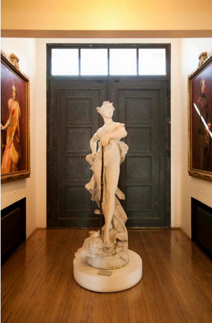
The Maryhill Museum of Art's collection will get more room to breathe with a recently-announced expansion.